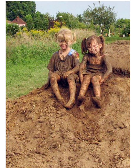
Fourth Annual Marine Mud Run—2007